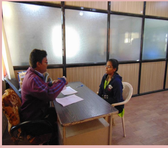
Program :- Campus Interview