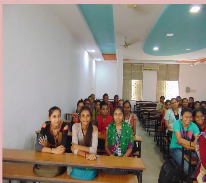
Program :- Women's Cooperative Training Class