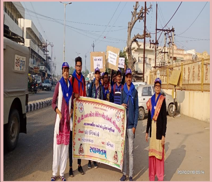
Program :- Fit India Rally Date :- 18-01-2020