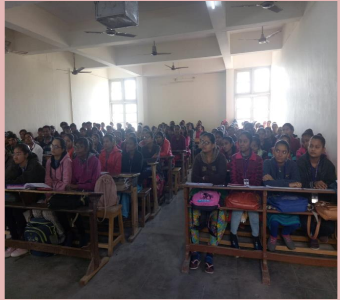
Program :- GPSC Related Seminar