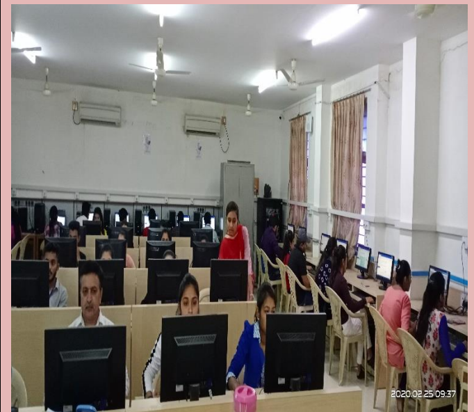
Program :- online exam feb-2020 Date :- 05-02-2020