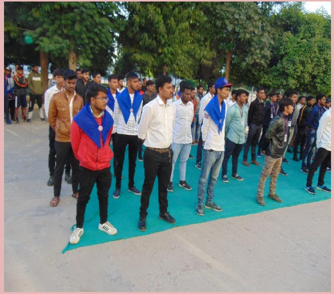
Program :- 26th January 2020