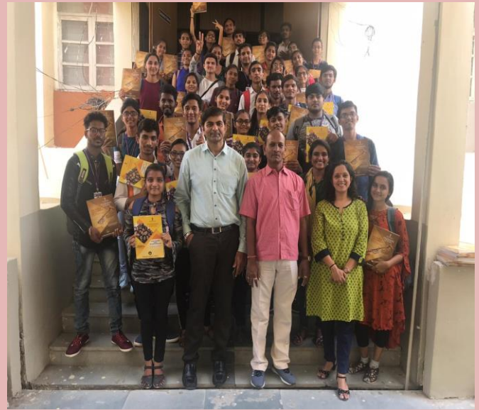
Program :- Finishing School Class