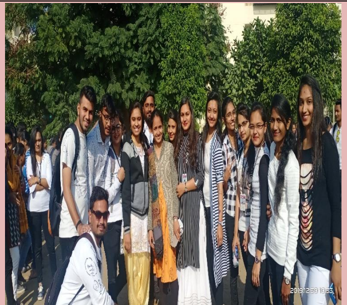
Program :- Signature Day