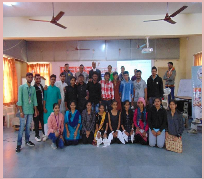
Program :- Anti-tobacco awareness campaign