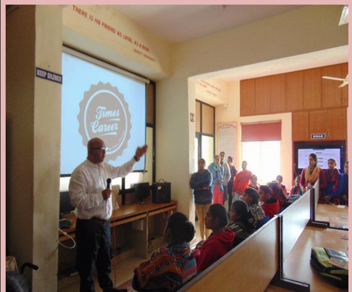
Program :- Guidance Seminar on Foreign University Introduction Date :- 09-01-2020