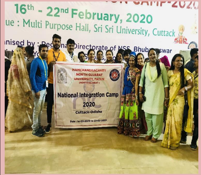
Program :- Selection in NIC Camp Date :- 16-02-2020