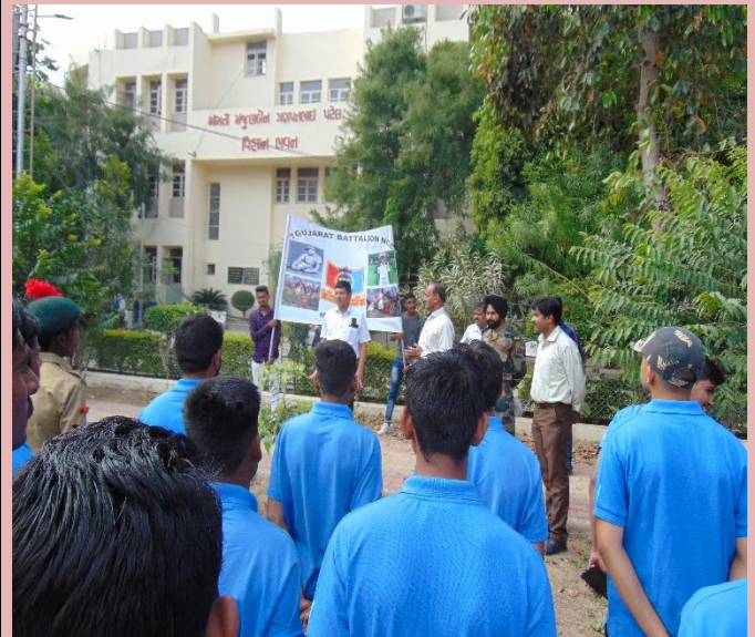
Program :- પ્લાસ્ટિક મુક્ત ભારત અભિયાન (Plastic Free India Campaign)