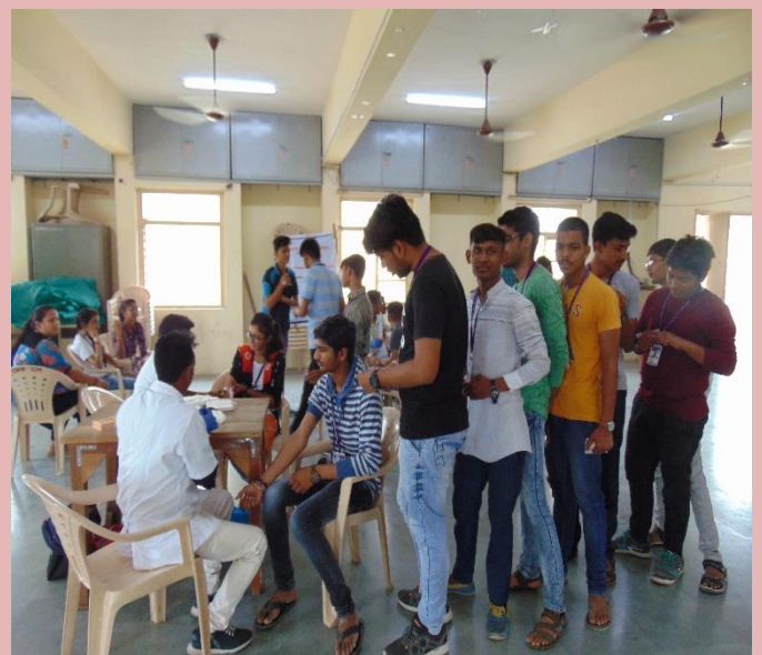
Program :- Thalassemia Test