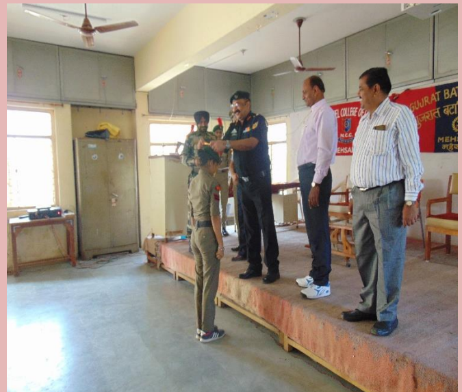
Program :- Medal distribution program