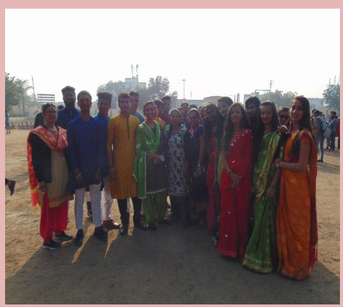
Program :- Sari Day