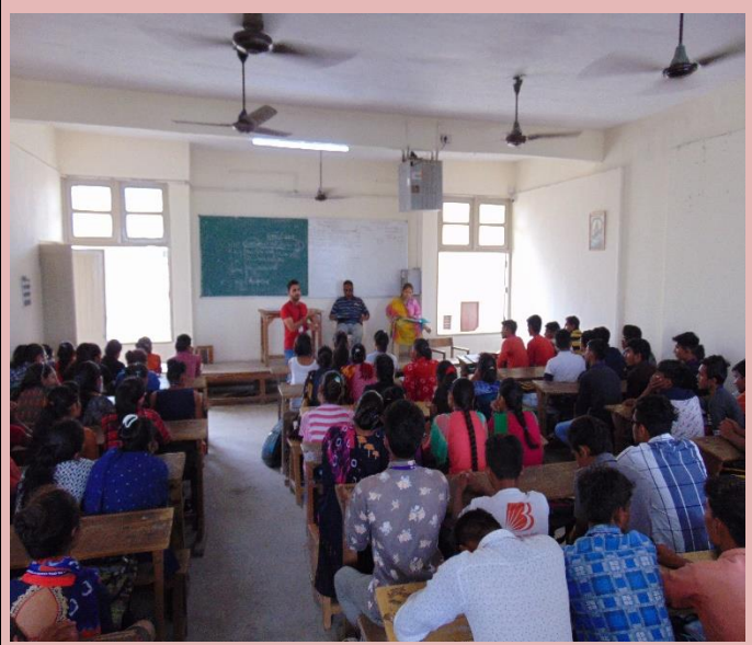
Program :- Eloquent Competition