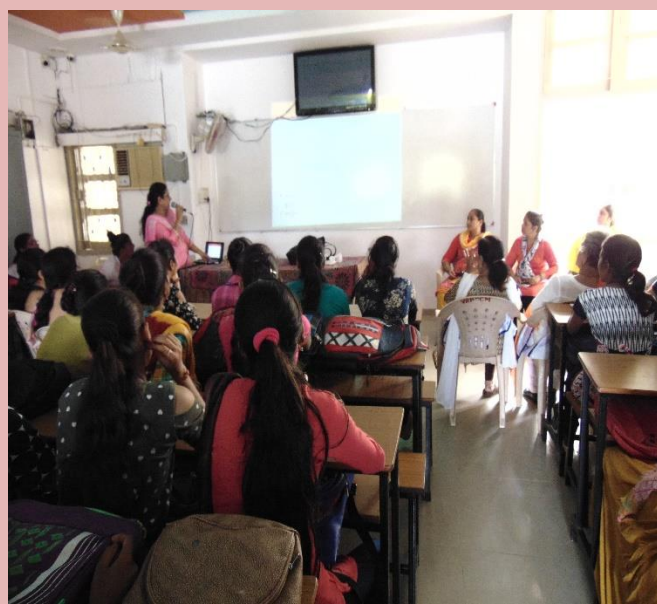
Program :- Women Empowerment