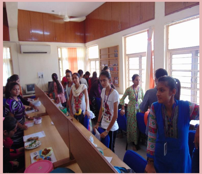
Program :- Cooking Competition