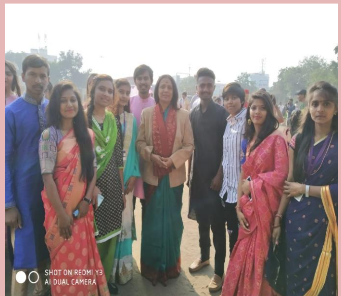
Program :- Traditional Day