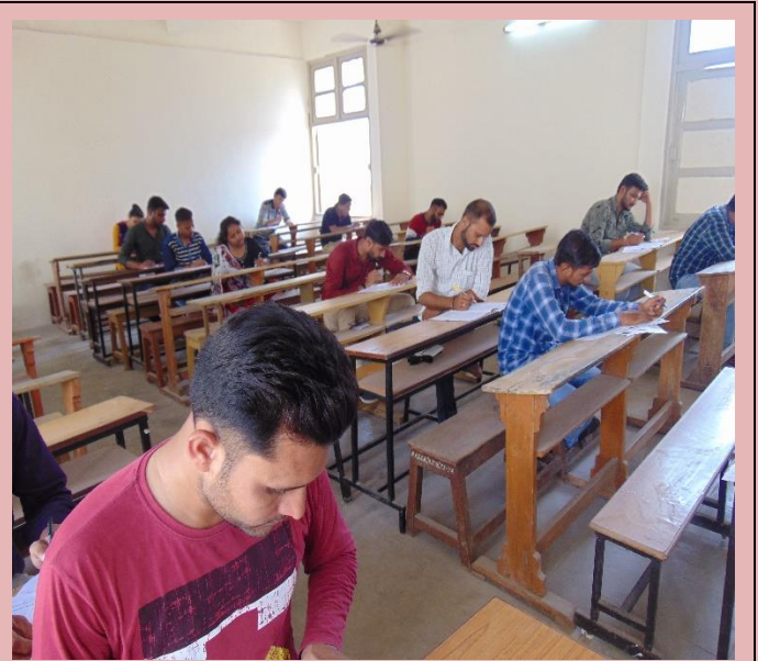
Program :- GPSC PSI EXAM Date :- 29-06-2019