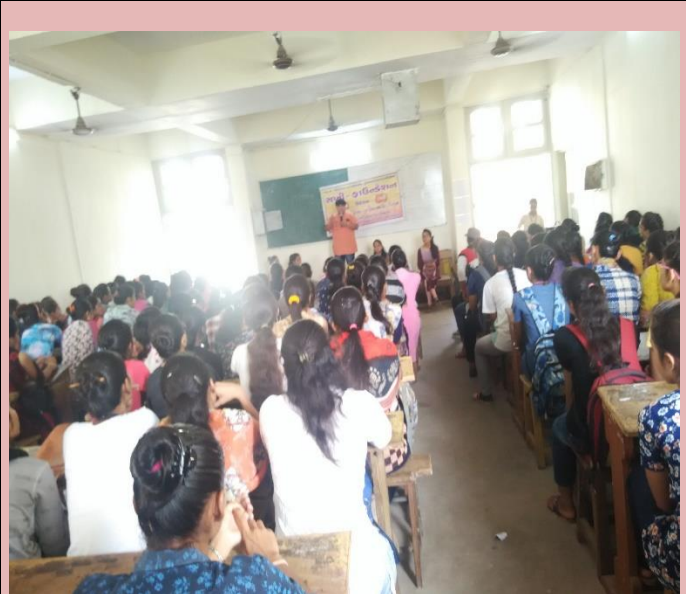
Program :- Women's economic development seminar