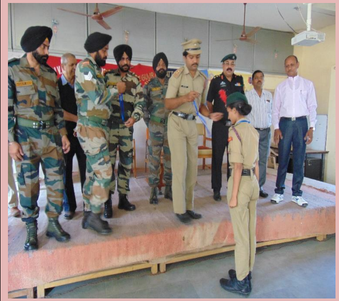
Program :- NCC Medal Distribution Program