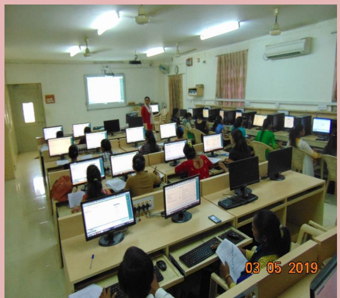
Program :- Tally accounting Course April