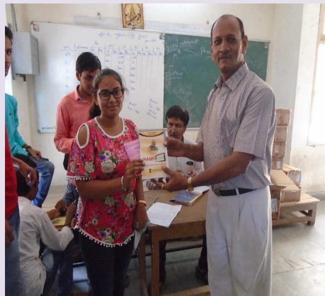
Program :- Tablet Distribution Date :- 07-09-2017