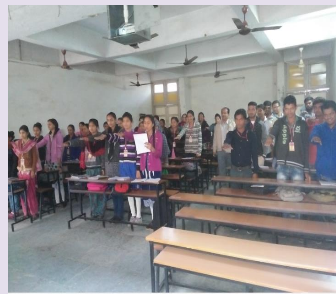
Program :- Guru purnima Date :-