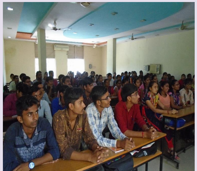
Program :- Export Import Seminar