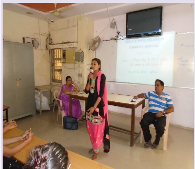
Program :- Elocution competition Date :- 09-08-2017