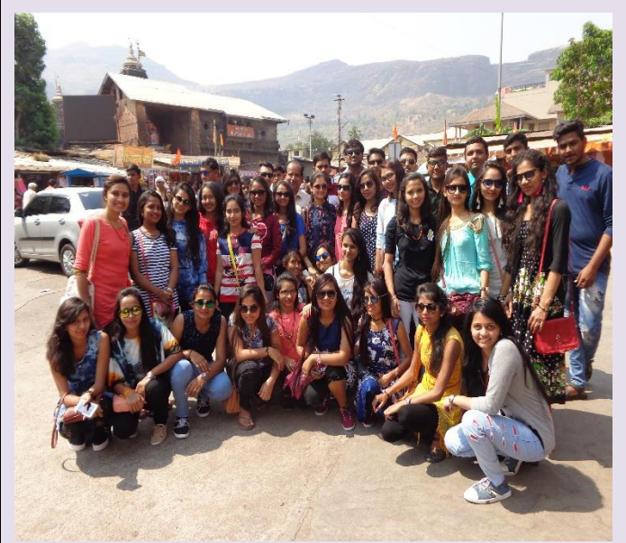
Program :- Tour (Serdi – Nasik)