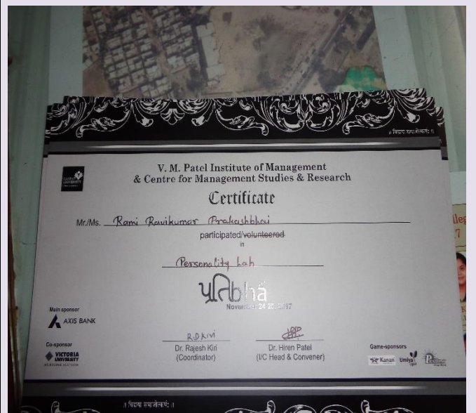
Program :- Pratibha - Ganpat Uni Date :- 24-25-Nov.-2017