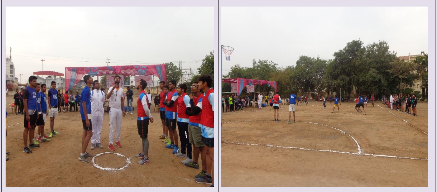
Program :- Sports