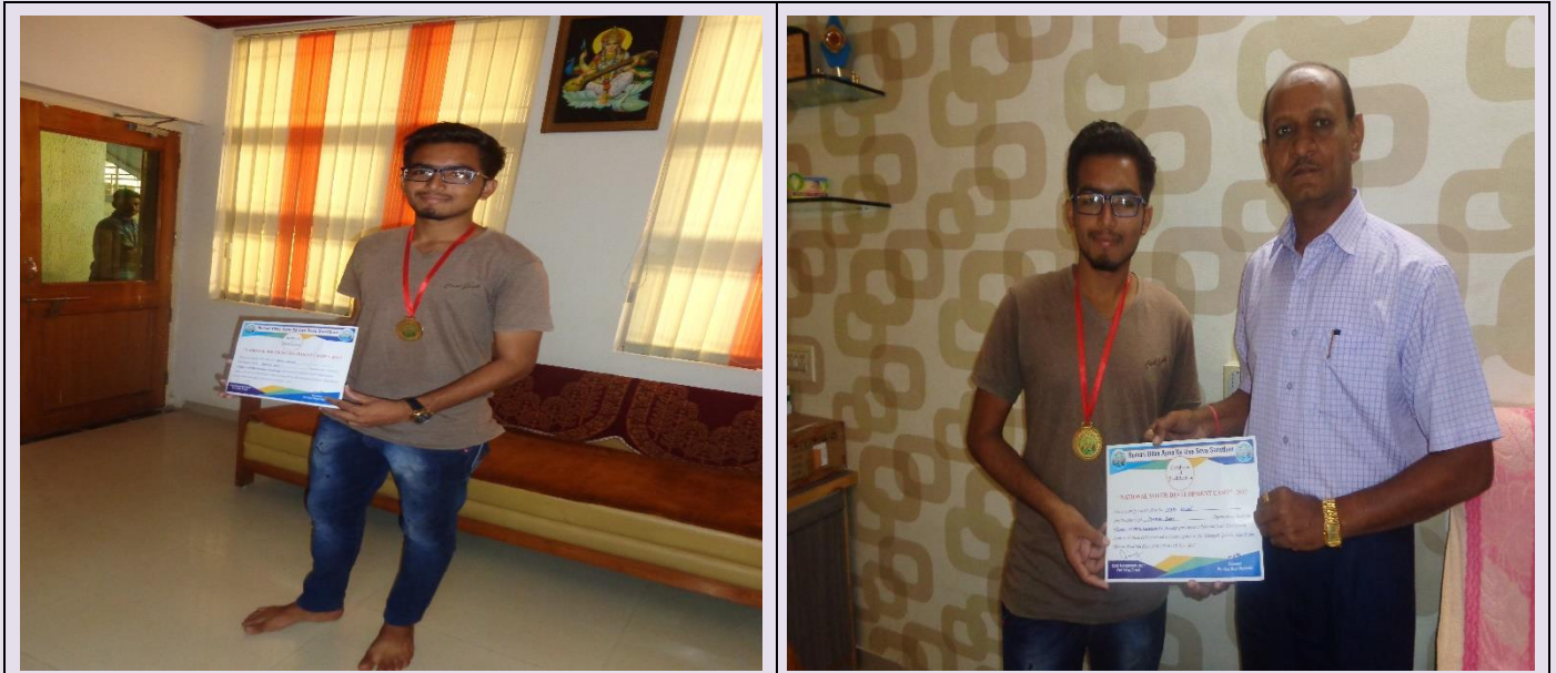
Program :- National Youth Development Camp