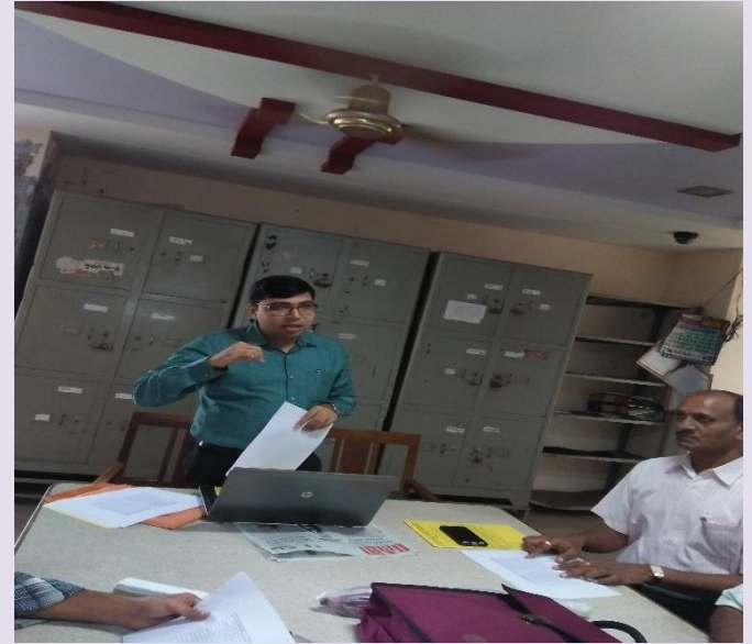
Program :- SIP Training Program Date :- 26-07-2017