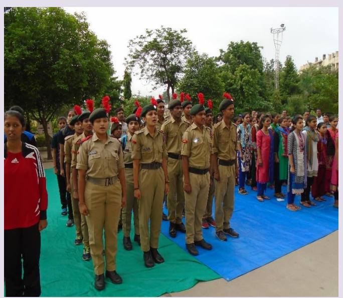
Program :- 15 August Date :- 15-08-2017