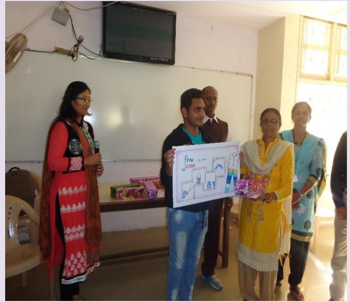
Program :- Advertisement Workshop Date :- 30-09-2017