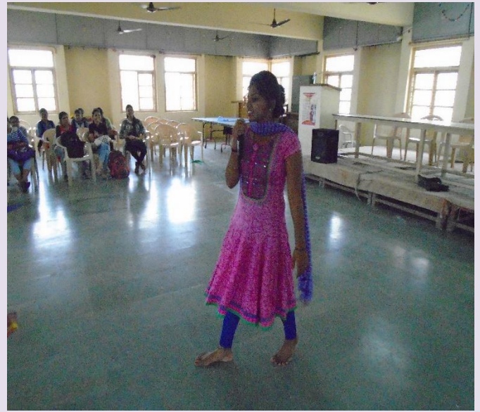
Program :- Play Competition