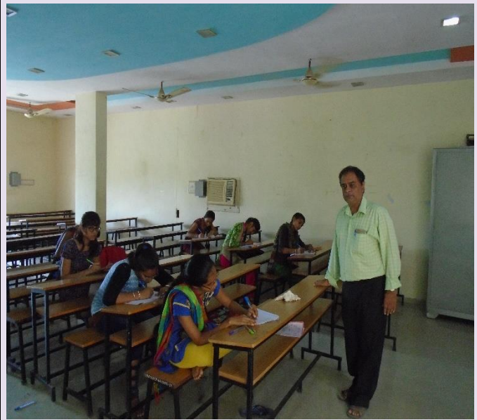
Program :- Essay competition Date :- 08-08-2017