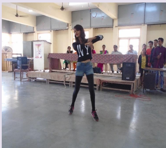
Program :- Git sangit dhara Date :- 10-08-2017