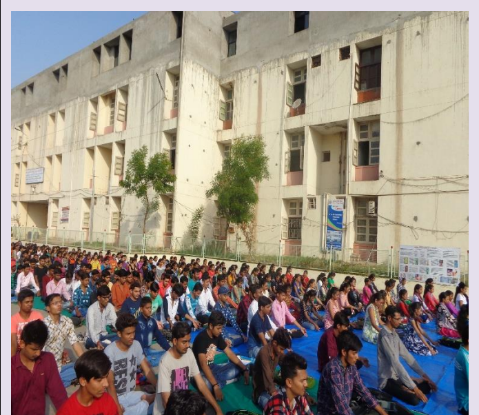
Program :- Yoga Day