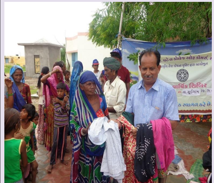
Program :- Nss Camp zaloya Date :-10-08-2017 to 16-08-2017