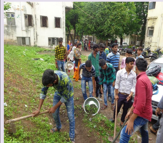
Program :- Tree plantation Date :- 19-08-2017