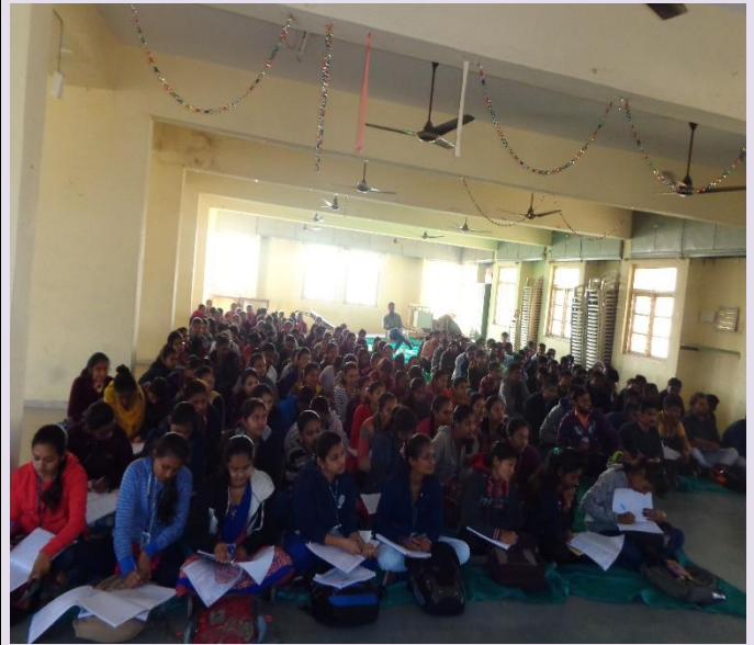
Program :- GST Seminar