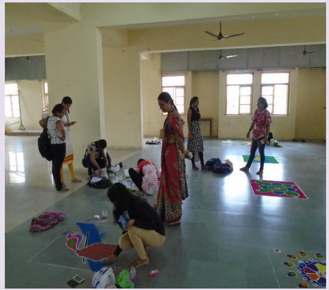
Program :- Rangoli Competition