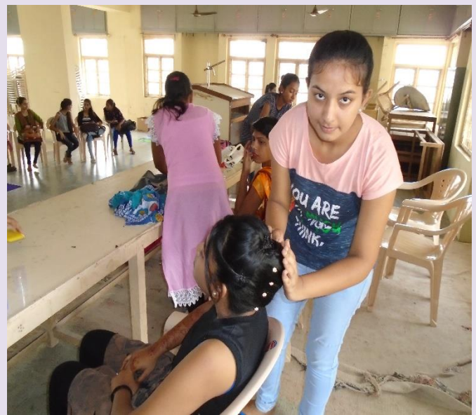
Program :- Hair Style Competition