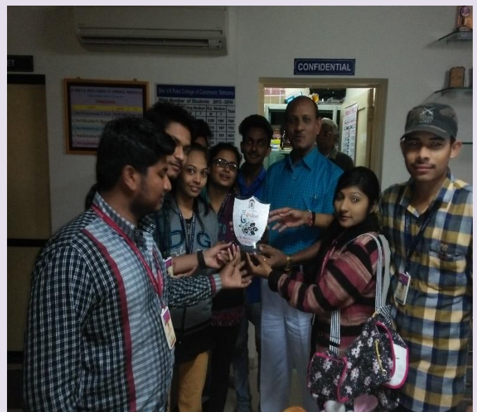
Program :- Youth Festival Date :-