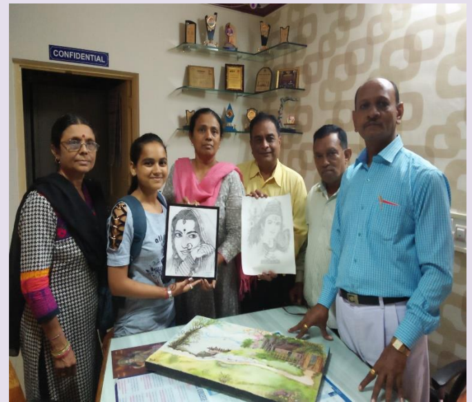
Program :- Painting Date :- 08-08-2017