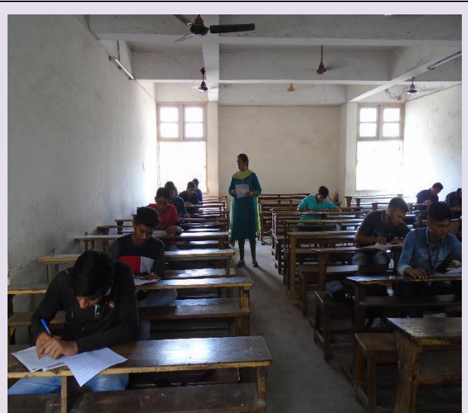
Program :- GK Test Date :-